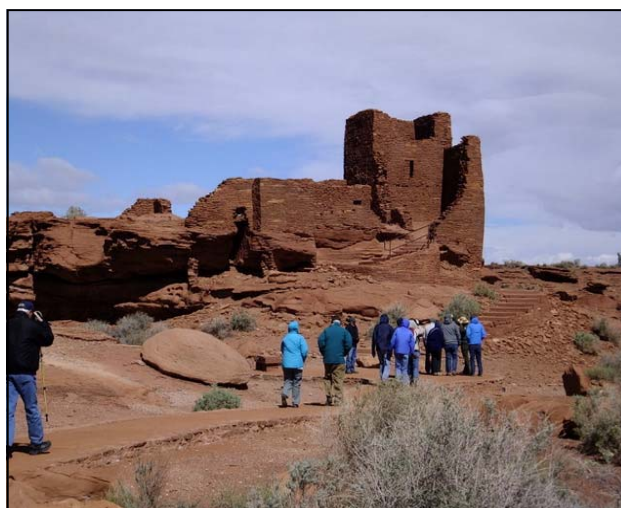
Yavapai chapter members trek to a pueblo at Wupatki National Monument.