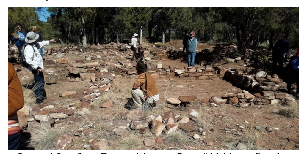
Scott and Goat Camp Tour participants at Room 8 Multiroom Complex