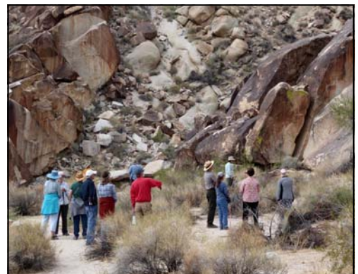
At Grapevine Canyon.