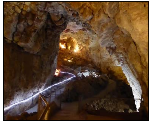
Inside Grand Canyon Caverns.