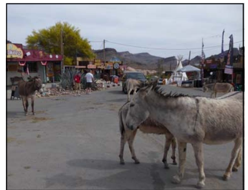
Oatman's ambassadors of goodwill.