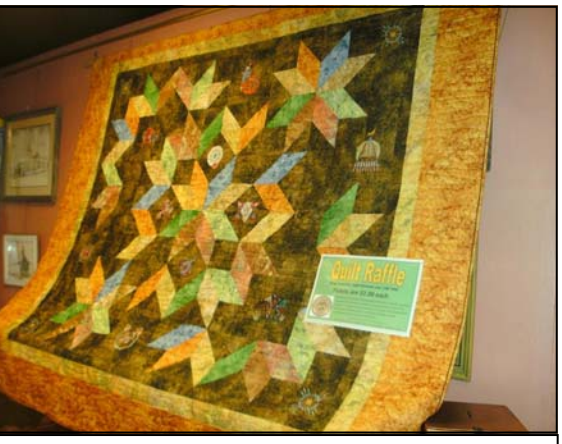
The Travelling Quilt

For more information and to register, go to http://regonline.com/southwestsymposium.