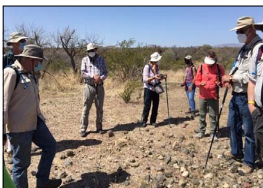
Viewing an Agave Roasting Pit