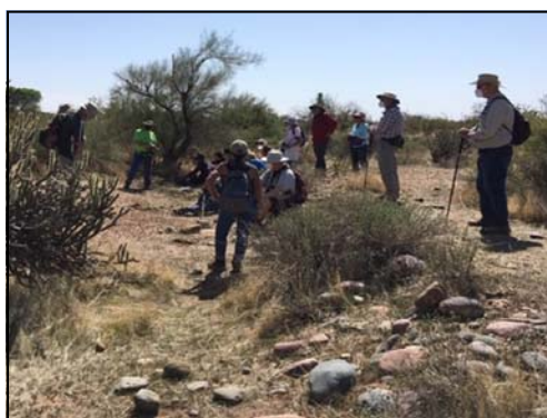
Azatlan Irrigation Canal