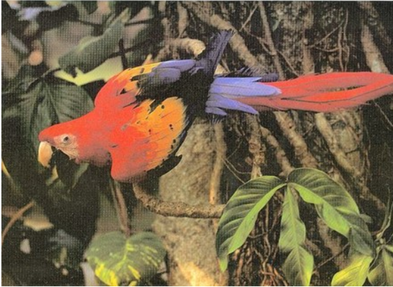
Macaw in Tree.