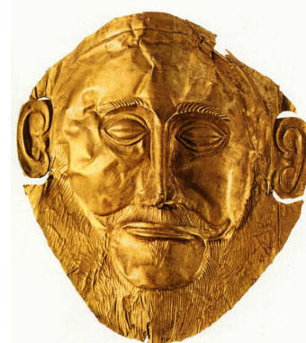
Ancient artifact interpreted as the death mask of Agamemnon