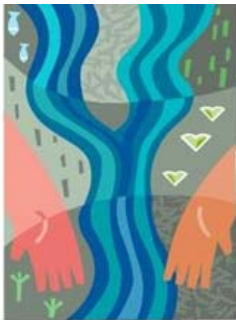
Wet/Dry Mapping on the Upper Agua Fria River!

The Upper Agua Fria Watershed Partnership and the Friends of the Agua Fria National Monument in cooperation with the Bureau of Land Management are seeking Team Members to volunteer for the 6th Annual Wet Dry Mapping on the Upper Agua Fria River . Mapping will take place on Saturday, June 22, 2013.