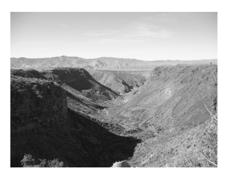
PERRY TANK CANYON

April 7, 8 am-4 pm, Wednesday April 10 & 11, 8 am-4 pm, Saturday and Sunday April 21, 8 am-4 pm, Wednesday